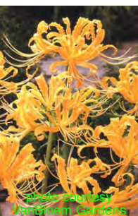
Spring Bulbs at WarmHorn Gardens

Get 'em in the ground now! Soil temperatures are finally cool enough for you to plant your spring flowering Bulbs! We still have lots of gorgeous Daffodils and Narcissus and Iris, and even some summer bloomers such as fragrant Stargazer Lilies and Lycoris, or Surprise Lily, with its spidery flowers in both the common red and in a most unusual yellow.