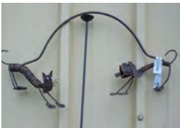
Cat and Dog Balance

So cute, they'll make your head "spin"! We have a great selection of Garden Balances and other unusual decorative accent pieces such as Flower Aquariums and Pansy Rings in stock for dressing up your own home or to give away as gifts! Hurry in to get the very best pick!