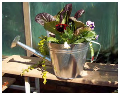
Cute Watering Can planter filled with seasonal color