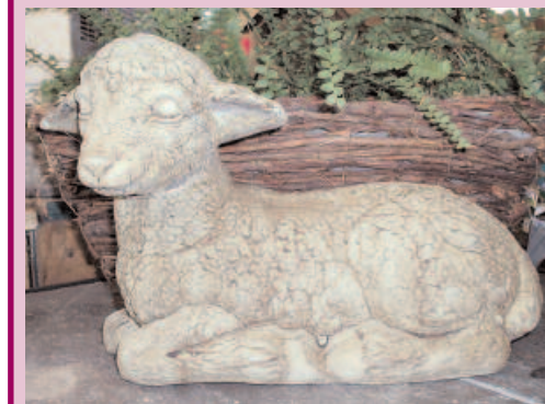
precious Resting Lamb statue by Unique Stone

so if you are interested in having living ryegrass baskets, you'll need to get them started by the middle of the month for them to fill in properly. Come check out our way-too-cute assortment of Lambs, Chicks, and Bunnies that are perfect for decorating your Passover and Easter tables. We've got statuary and pots available!